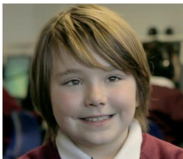
Tried and tested